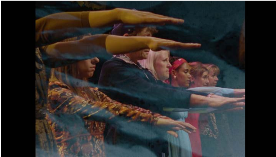
Image 1: We Put the World Before You, Jane & Louise Wilson, 2016.