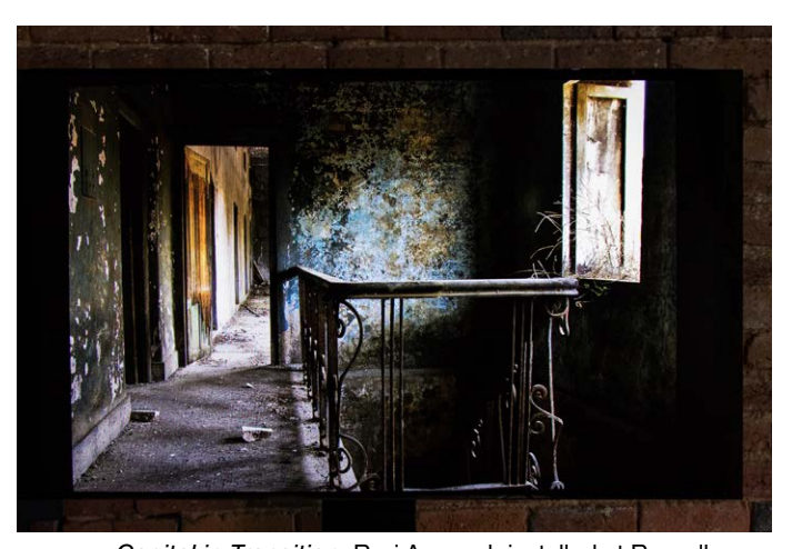
Capital in Transition, Ravi Agarwal, installed at Roundhouse

The Roundhouse in Birmingham is a horseshoe-shaped building, with a circular cobbled courtyard that used to reverberate to the sound of hooves. A stable for the horses that would ferry countless cartloads of goods from the building's canalside frontage into and out of Birmingham, it was also a storehouse for materials, including the stone – called Rowley Rag – that would pave the city's growing radius of streets. That former incarnation as a bunker for stone provides an ideal setting for Omar Chowdhury's video STONEWORK , whose black and white footage, and scenes of gruelling, repetitive manual labour, evoke a bygone era, with